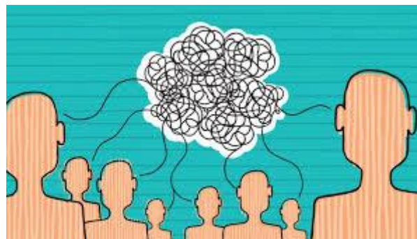
Figure 3: Universal [2]

The question must be pragmatically functional, morphosyntactically adequate for the answer to be an answer. Women often ask questions. Men do not. Women often gossip. Men are physically more aggressive. Women spread gossip. Women do participate in the transmission of gossip. I do use the cell phone and willingly or unwillingly hear something about something or someone, remember what I hear, sometimes convey what was said and how it was said. Sometimes something like that happens? I sometimes say something similar?