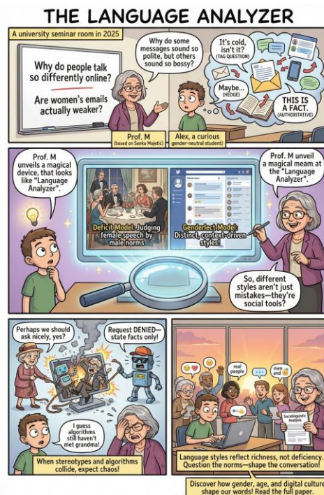
Figure 1: NLP [1]