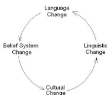
Figure 4: (The) Change [2]

I need to use language that others will understand. I don't want to talk and explain for a long time? Also, I don't want to be aggressive? The message should be pragmatically simple? When I spoke before, I achieved what I wanted.