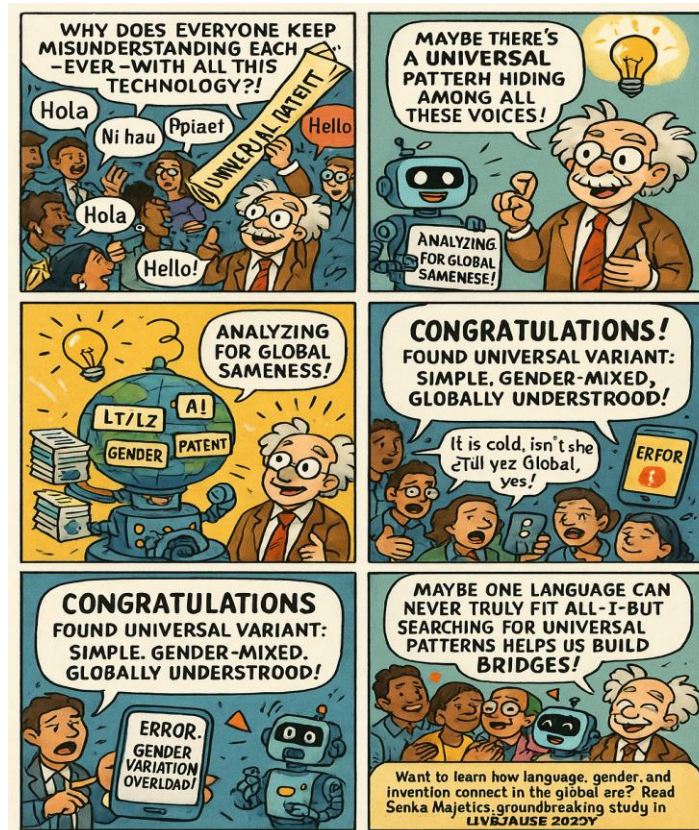
Figure 6: Global Universal [1]