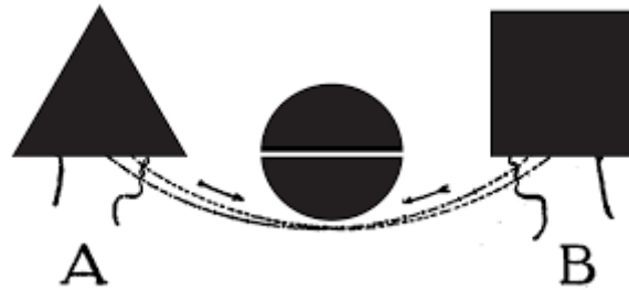
Figure 2: A+=B [2]

If I hear something about someone, I should repeat what I heard, as said. Is it a repeat? The same words, the same phrase used to describe someone?